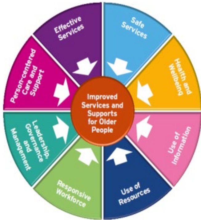
Figure 1: Themes in the National Standards